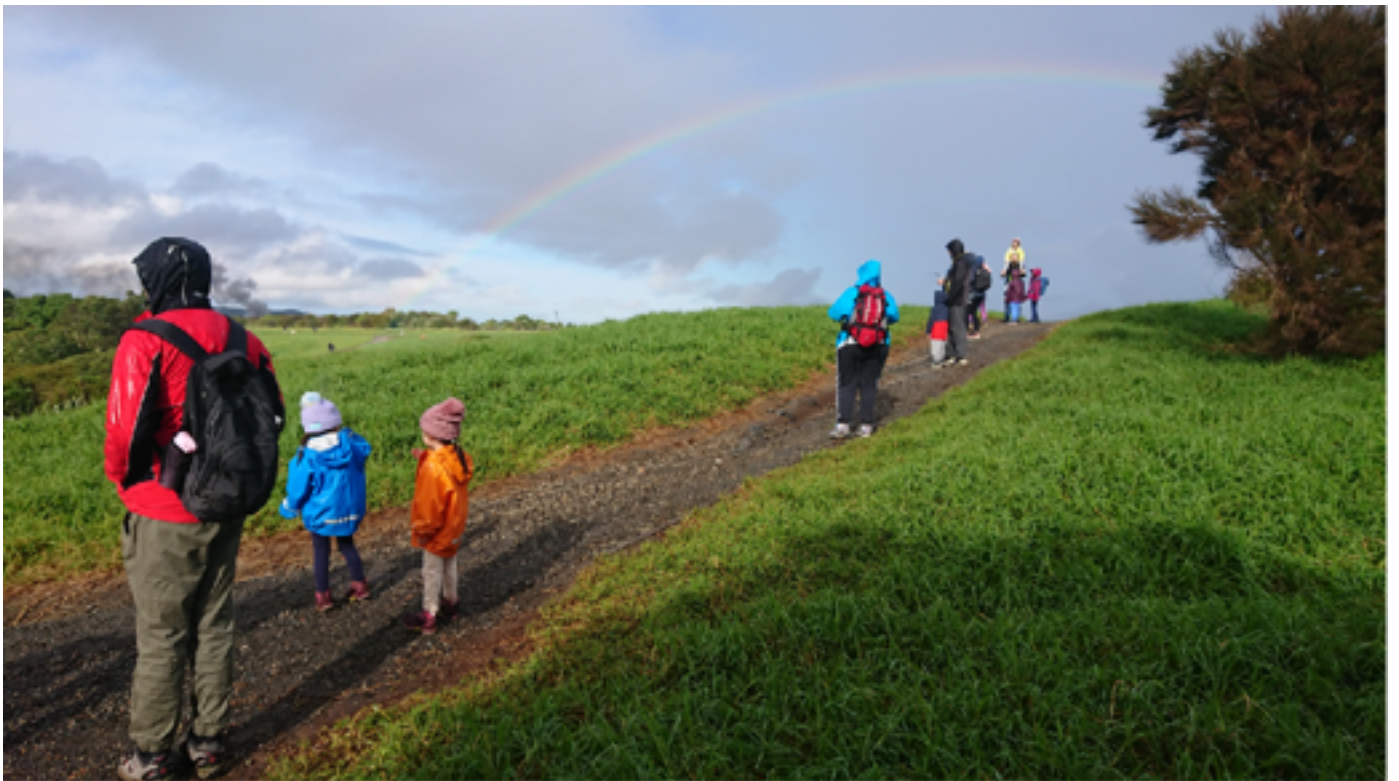
Small People on Big Hills under a rainbow on their recent walk