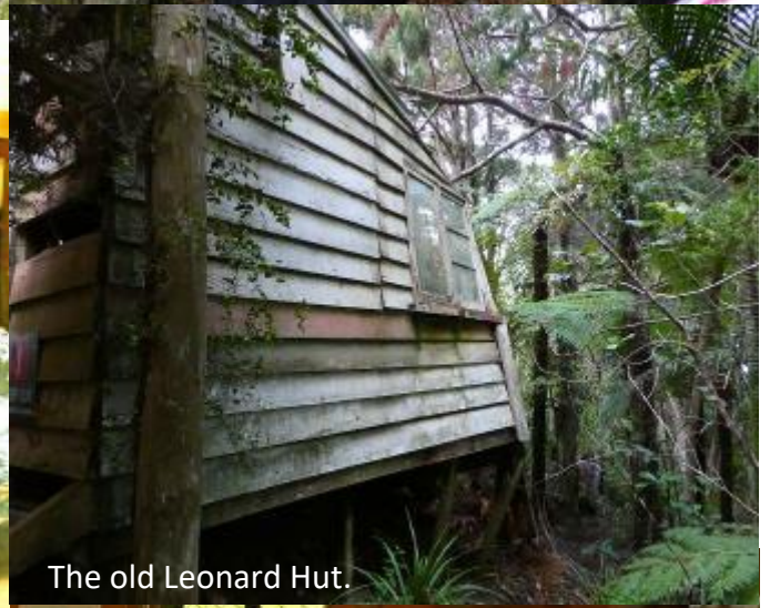
The old Leonard Hut.