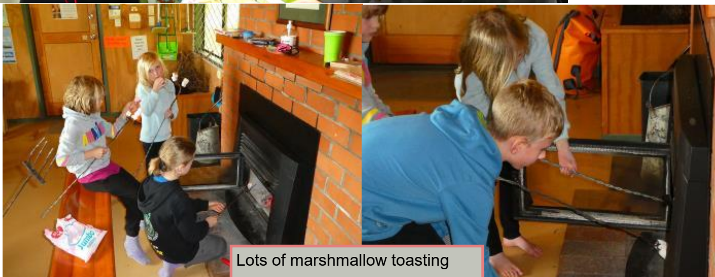
Lots of marshmallow toasting