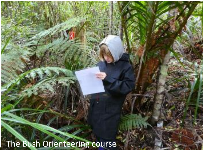
The Bush Orienteering course