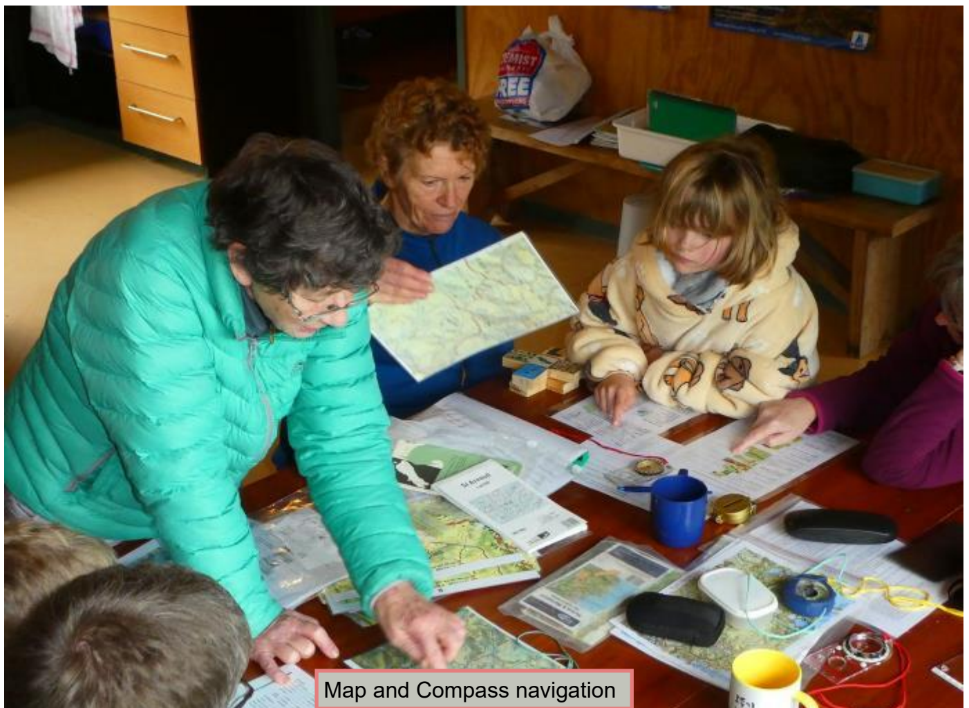
Map and Compass navigation