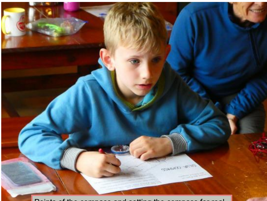
Points of the compass and setting the compass for real