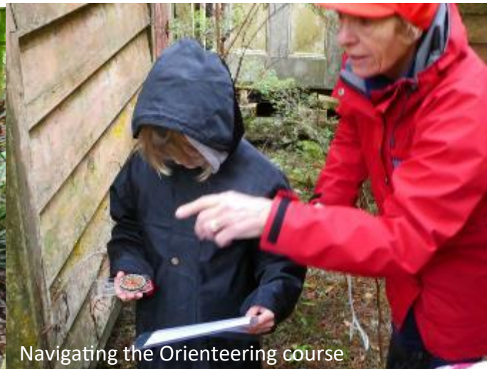
Navigating the Orienteering course