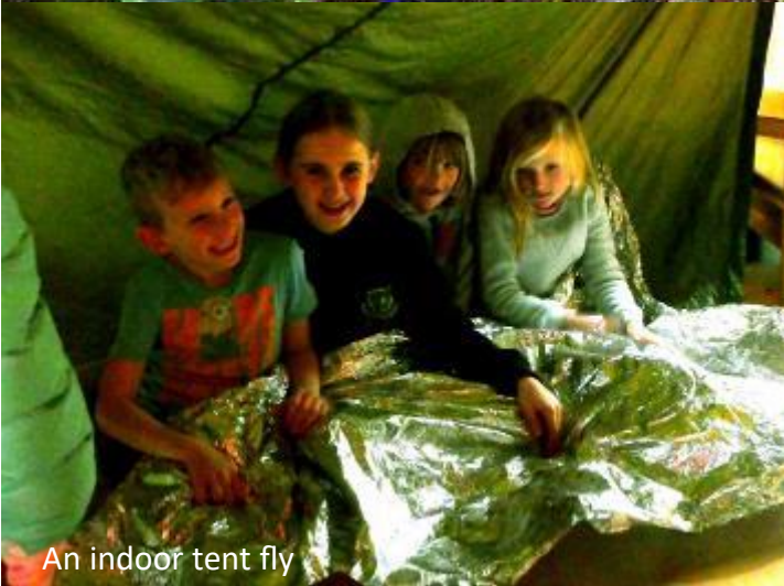
An indoor tent fly