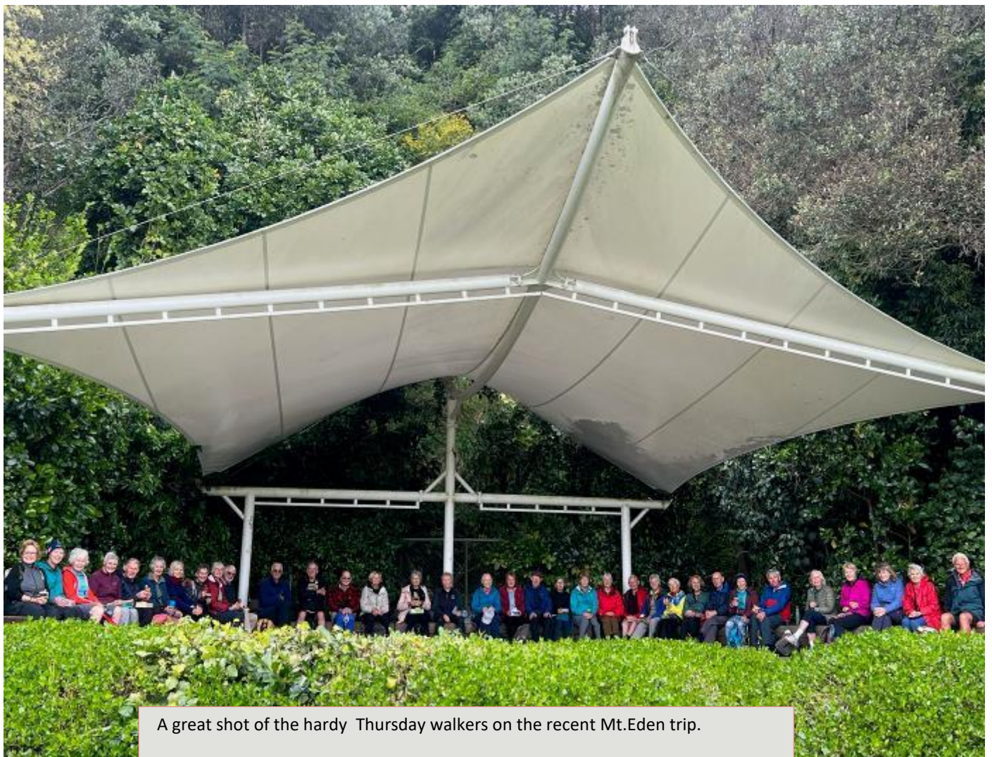
A great shot of the hardy Thursday walkers on the recent Mt.Eden trip.

From there it was a short walk to The Pines estate in Owens Road and a stroll through its colourful gardens. Then it was back to the cars, sadly too late for coffee at the Eden Gardens café. However everyone ( even those who live in Mt.Eden ) discovered some place that they had not been before and were intrigued by the rail project, so it was considered a successful excursion.