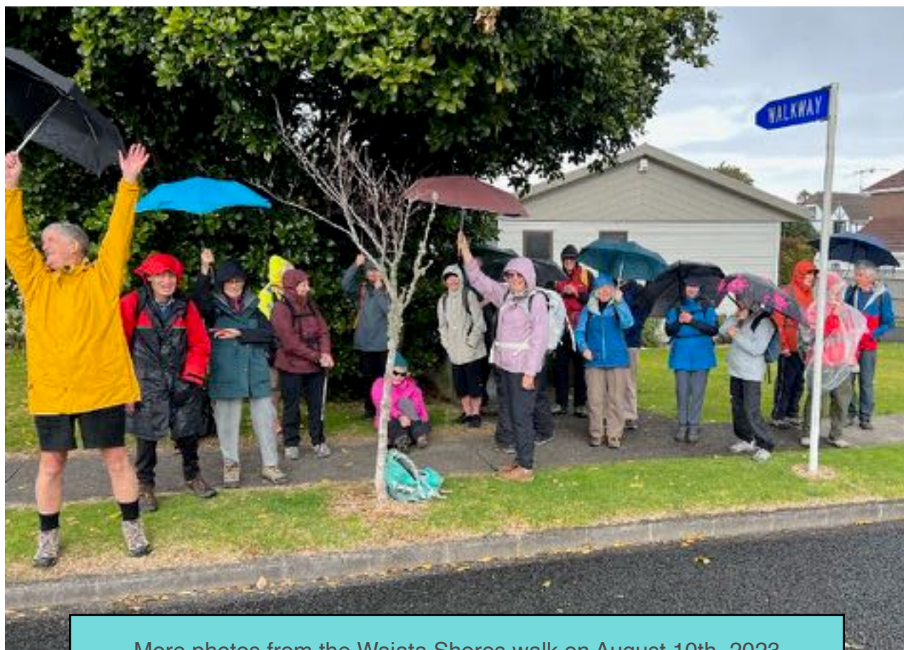
More photos from the Waiata Shores walk on August 10th, 2023